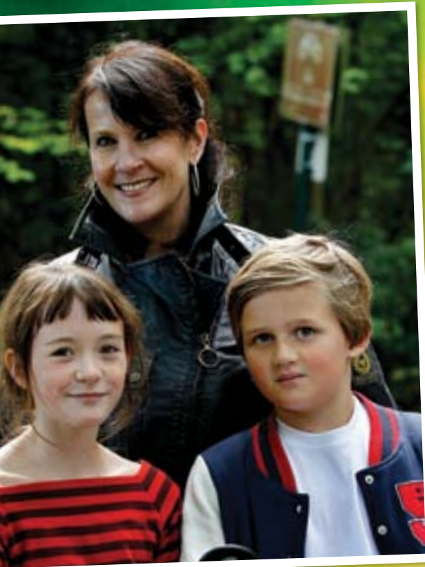
Vigdis Hjort on set with "Anne" and "Jørgen"

The book is a Norwegian best-seller from 1984 written by Vigdis Hjorth. It is still one of the most popular books in both bookstores and at the Libraries.