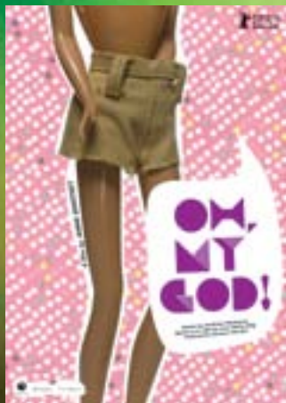
Oh My God!